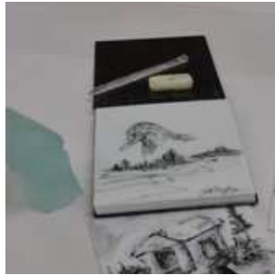
3D/Mixed Media Profes...