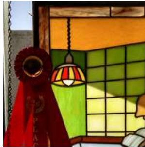
Stained Glass Amateur...