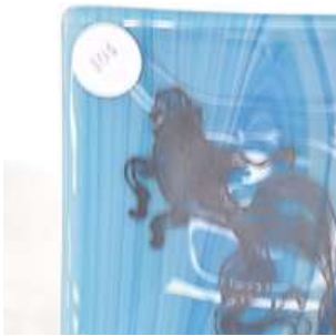
Glass Imagery - 1st Plac...