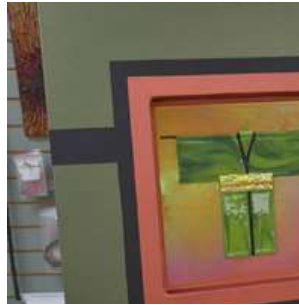
3D/Mixed Media Profes...