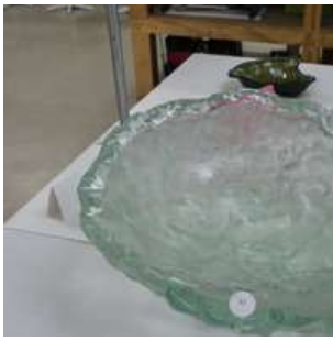
Kiln-Formed Glass Prof...