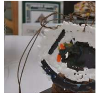
3D/Mixed Media Amate...