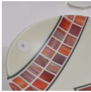
Kiln-Formed Glass Ama...