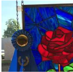
Stained Glass Amateur...