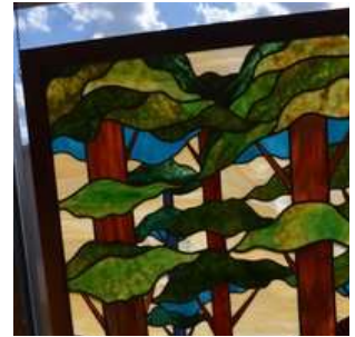
Stained Glass Professio..