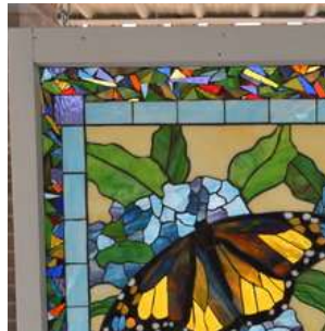
Glass Mosaic - 1st Place