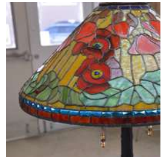
Glass Lamps - 1st Place