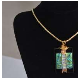
Glass Jewelry - 2nd Pla...