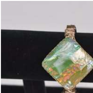
Glass Jewelry - 1st Place