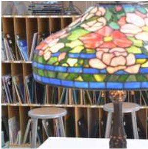
Glass Lamps - 2nd Plac...